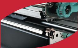
Adjustable sensor kit